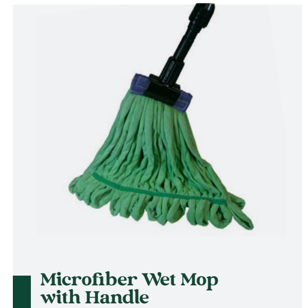
Microfiber Wet Mop with Handle