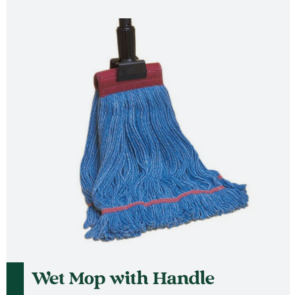
Wet Mop with Handle