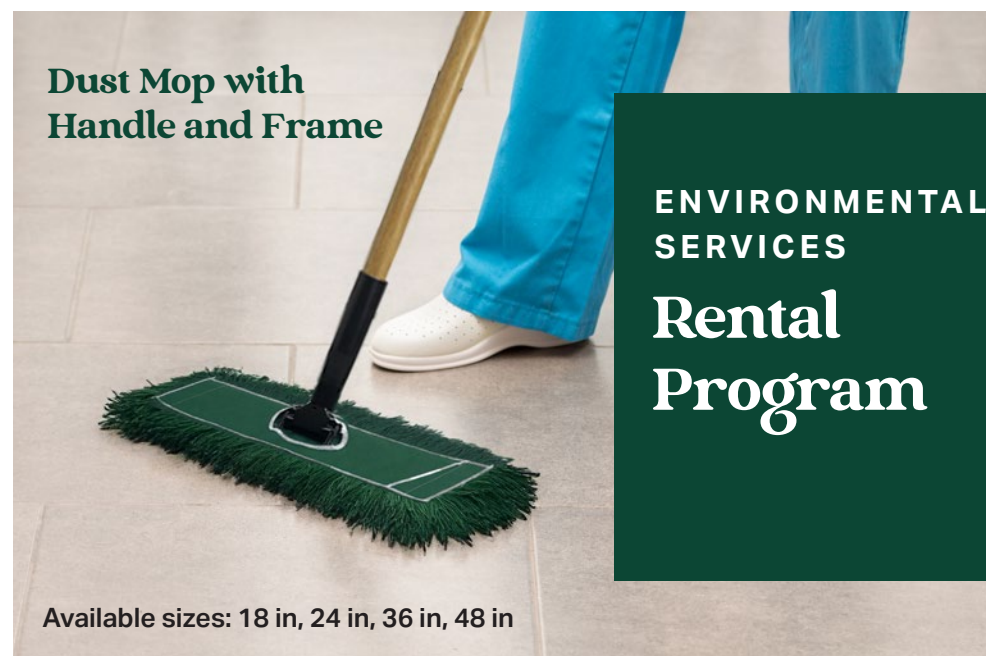
Dust Mop with Handle and Frame